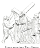
JESUS RECEIVES THE CROSS

Stations of the cross will take place every Friday during Lent at 7.30pm from the 20th February until the 27th March. We will make this journey and would like you to join us.